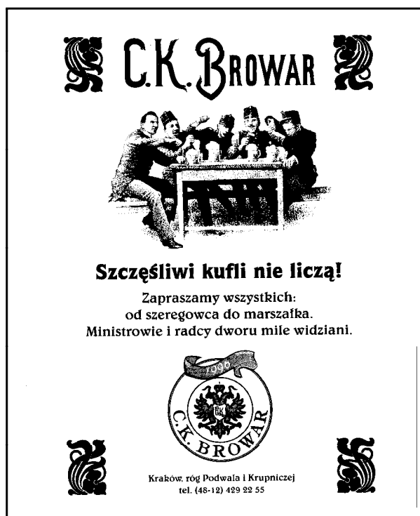
FIGURE 2 Advertisement for the C&K Brewery: 'our doors are open to everyone, from common soldier to sergeant. Ministers and imperial advisers are particularly welcome' (Czuma and Mazan, Austriackie gadanie czyli Encyklopedia Galicyjska , reprinted by kind permission of Anabasis, Krakow).

Beyond its role as simple marketing tool (discounted by many as merely a means of signalling the given product's long heritage and thus its worth vis-à-vis shoddy state